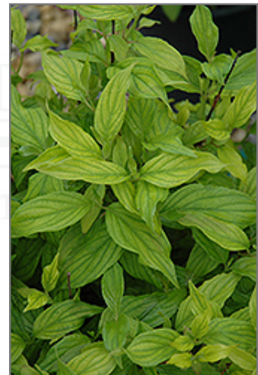
Kelsey Dogwood foliage