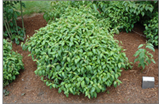
Kelsey Dogwood