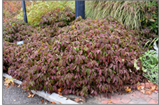
Kelsey Dogwood in fall

This shrub does best in full sun to partial shade. It is an amazingly adaptable plant, tolerating both dry conditions and even some standing water. It is not particular as to soil type or pH. It is highly tolerant of urban pollution and will even thrive in inner city environments. This is a selection of a native North American species.