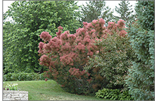
Royal Purple Smokebush in bloom

Royal Purple Smokebush is a multi-stemmed deciduous shrub with an upright spreading habit of growth. Its average texture blends into the landscape, but can be balanced by one or two finer or coarser trees or shrubs for an effective composition.