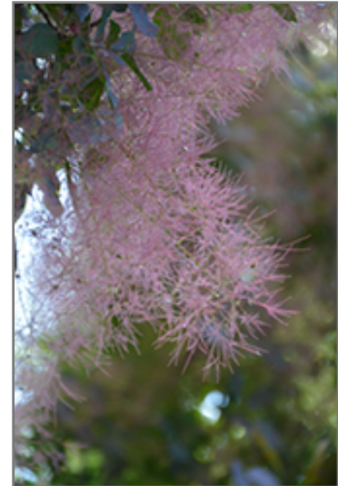
Royal Purple Smokebush flowers

This shrub should only be grown in full sunlight. It is very adaptable to both dry and moist locations, and should do just fine under average home landscape conditions. It is not particular as to soil type or pH. It is highly tolerant of urban pollution and will even thrive in inner city environments, and will benefit from being planted in a relatively sheltered location. This is a selected variety of a species not originally from North America.