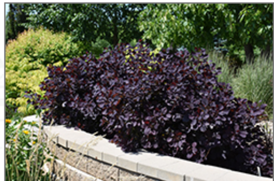
Royal Purple Smokebush