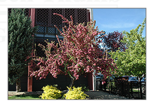
Toba Hawthorn in bloom