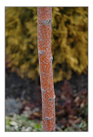
Toba Hawthorn bark

This tree does best in full sun to partial shade. It is very adaptable to both dry and moist growing conditions, but will not tolerate any standing water. It is not particular as to soil type or pH. It is somewhat tolerant of urban pollution. This particular variety is an interspecific hybrid.