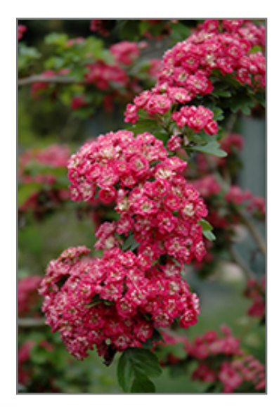
Toba Hawthorn flowers

This is a relatively low maintenance tree, and is best pruned in late winter once the threat of extreme cold has passed. Gardeners should be aware of the following characteristic(s) that may warrant special consideration;