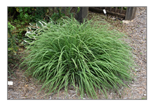
Prairie Fire Red Switch Grass

Prairie Fire Red Switch Grass will grow to be about 4 feet tall at maturity, with a spread of 3 feet. It tends to be leggy, with a typical clearance of 1 foot from the ground, and should be underplanted with lower-growing perennials. It grows at a medium rate, and under ideal conditions can be expected to live for approximately 15 years. As an herbaceous perennial, this plant will usually die back to the crown each winter, and will regrow from the base each spring. Be careful not to disturb the crown in late winter when it may not be readily seen!