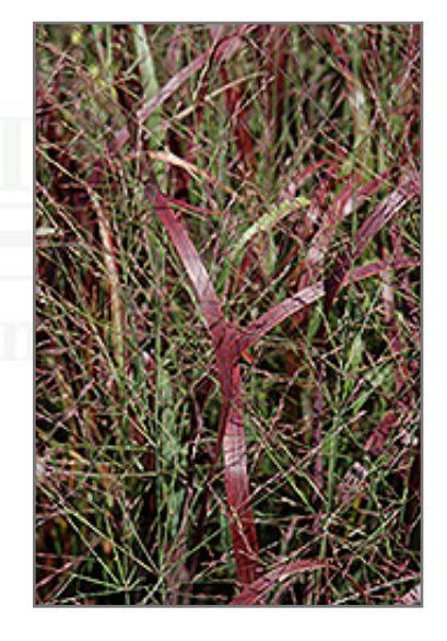
Prairie Fire Red Switch Grass foliage