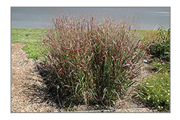
Prairie Fire Red Switch Grass

Prairie Fire Red Switch Grass is recommended for the following landscape applications;