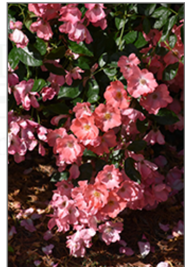
Flower Carpet Coral Rose flowers