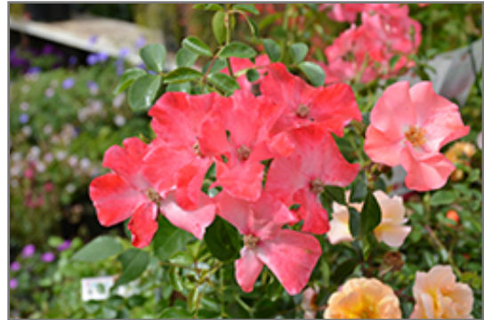
Flower Carpet Coral Rose flowers

Flower Carpet Coral Rose is a dense multi-stemmed deciduous shrub with an upright spreading habit of growth. Its average texture blends into the landscape, but can be balanced by one or two finer or coarser trees or shrubs for an effective composition.