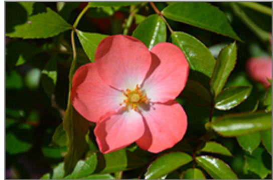
Flower Carpet Coral Rose flowers