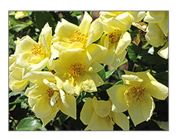
Flower Carpet Yellow Rose flowers

Masses of yellow blossoms with cream centers are presented on this true easy care groundcover rose; simple to grow and easy to maintain with no spraying; cut back to one third in late winter