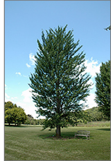
Princeton Sentry Ginkgo

This is a relatively low maintenance tree, and is best pruned in late winter once the threat of extreme cold has passed. Deer don't particularly care for this plant and will usually leave it alone in favor of tastier treats. It has no significant negative characteristics.