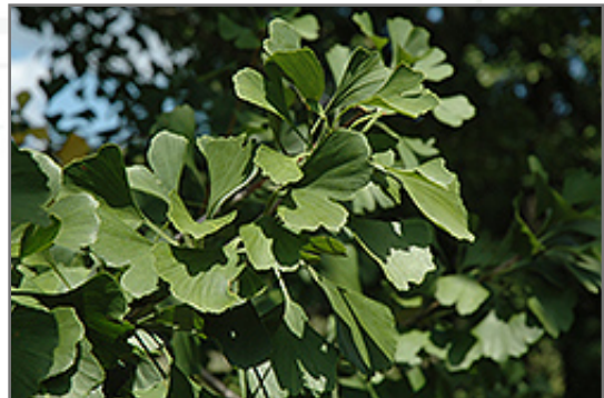
Princeton Sentry Ginkgo foliage