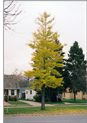
Princeton Sentry Ginkgo in fall

This tree should only be grown in full sunlight. It is very adaptable to both dry and moist locations, and should do just fine under average home landscape conditions. It is not particular as to soil type or pH, and is able to handle environmental salt. It is highly tolerant of urban pollution and will even thrive in inner city environments. Consider applying a thick mulch around the root zone in winter to protect it in exposed locations or colder microclimates. This is a selected variety of a species not originally from North America.