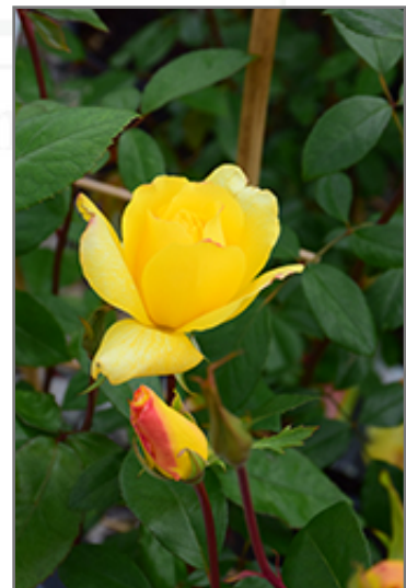
Golden Showers Rose flower buds