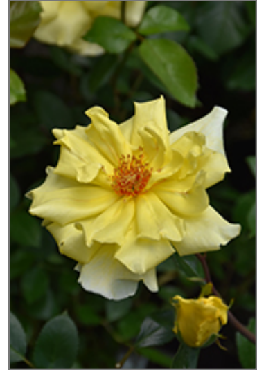
Golden Showers Rose flowers

This is a high maintenance woody vine that will require regular care and upkeep, and is best pruned in late winter once the threat of extreme cold has passed. It is a good choice for attracting bees to your yard. It has no significant negative characteristics.