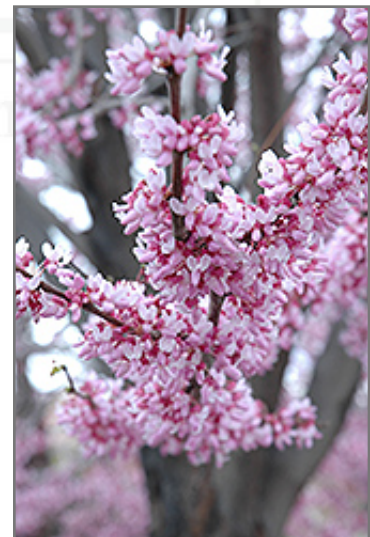
Eastern Redbud flowers