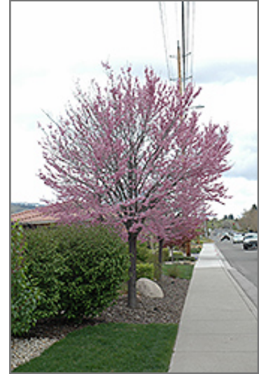
Eastern Redbud in bloom

Eastern Redbud is recommended for the following landscape applications;