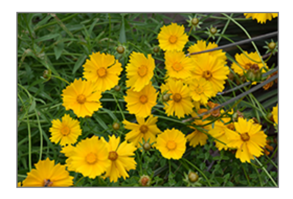
Lanceleaf Tickseed flowers