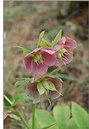
Pink Lady Hellebore flowers

Pink Lady Hellebore is recommended for the following landscape applications;