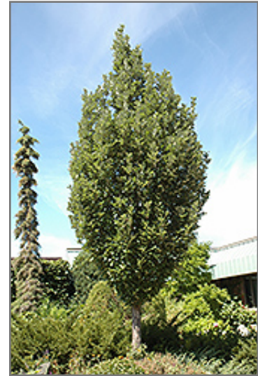
Crimson Spire Oak