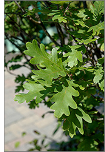
Crimson Spire Oak foliage

This tree should only be grown in full sunlight. It is very adaptable to both dry and moist locations, and should do just fine under average home landscape conditions. It is not particular as to soil type or pH. It is highly tolerant of urban pollution and will even thrive in inner city environments. This particular variety is an interspecific hybrid.