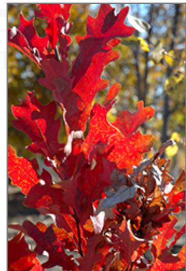
Crimson Spire Oak in fall