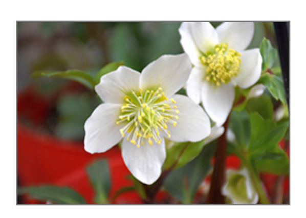
Gold Collection Jacob Hellebore flowers

Cup-shaped pure white flowers will age to light green; cool weather can produce pink tinged blooms; flowers emerge in late fall, when most others are finished; a welcome sight in the garden