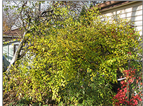
Double Flowered Japanese Kerria in fall

This shrub performs well in both full sun and full shade. It does best in average to evenly moist conditions, but will not tolerate standing water. It is not particular as to soil type or pH. It is highly tolerant of urban pollution and will even thrive in inner city environments. This is a selected variety of a species not originally from North America.