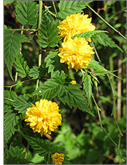
Double Flowered Japanese Kerria flowers

Double Flowered Japanese Kerria is a dense multi-stemmed deciduous shrub with an upright spreading habit of growth. It lends an extremely fine and delicate texture to the landscape composition which can make it a great accent feature on this basis alone.