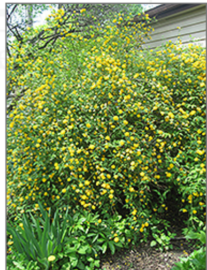
Double Flowered Japanese Kerria