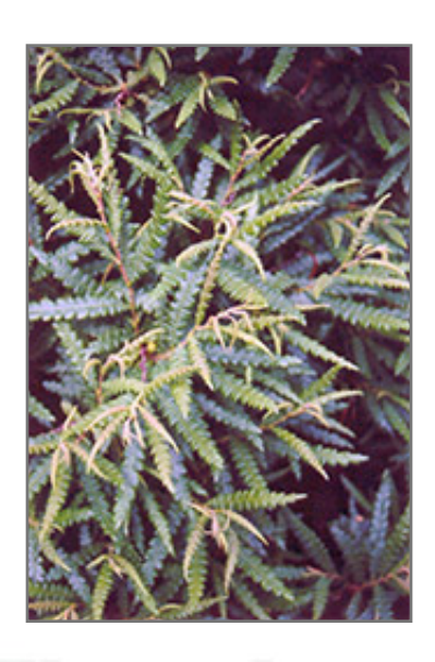
Sweetfern foliage

Sweetfern is recommended for the following landscape applications;