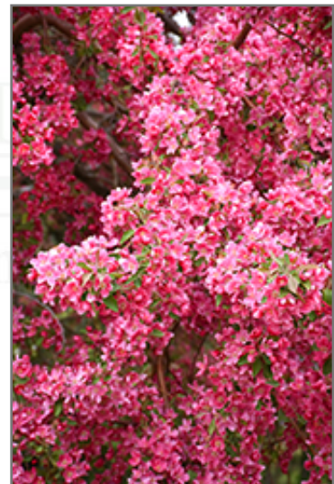
Prairifire Flowering Crab flowers