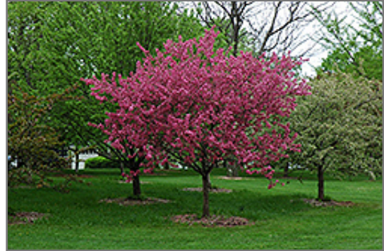
Prairifire Flowering Crab in bloom

Prairifire Flowering Crab is a deciduous tree with an upright spreading habit of growth. Its average texture blends into the landscape, but can be balanced by one or two finer or coarser trees or shrubs for an effective composition.