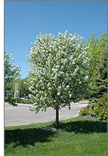
Spring Snow Flowering Crab in bloom

Spring Snow Flowering Crab is recommended for the following landscape applications;