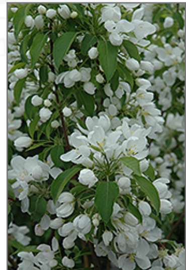
Spring Snow Flowering Crab flowers